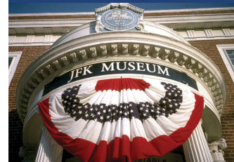
Visit to the JFK Museum