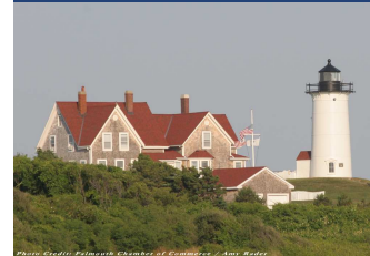
Lighthouse overlooking Vineyard Sound