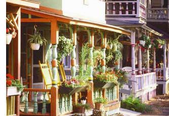
Historic seaside towns of Hyannis and Sandwich